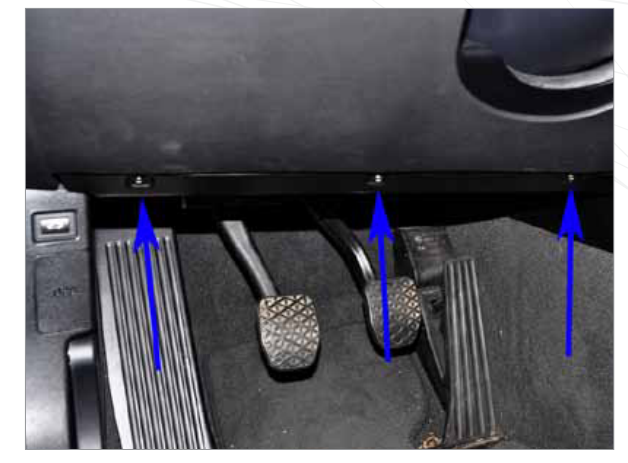
Remove the lower dash cover below the steering wheel by removing the three #20 torx screws shown here. Lay this cover down into the footwell.

Please download the latest copy of this document from www.p3cars.com/install