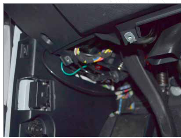
Replace the side kick panel and tuck/secure the control box and harness up above this panel near the other factory