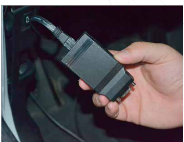
Feed the display wire down to the lower dash footwell area and connect it to the control box.