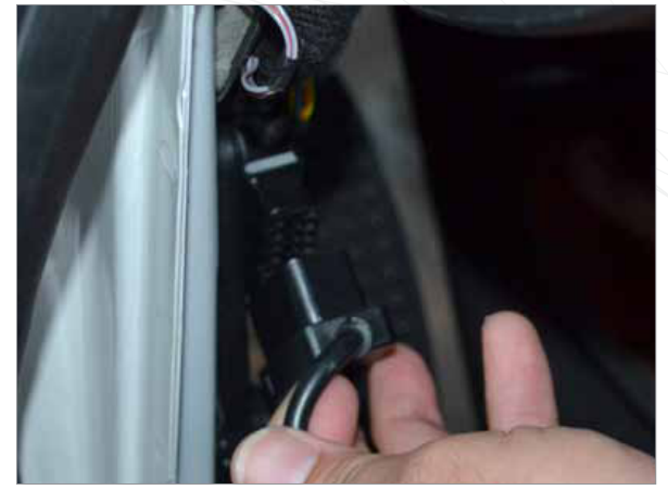
Plug in the obd2 connector to the car.

Please download the latest copy of this document from www.p3cars.com/install