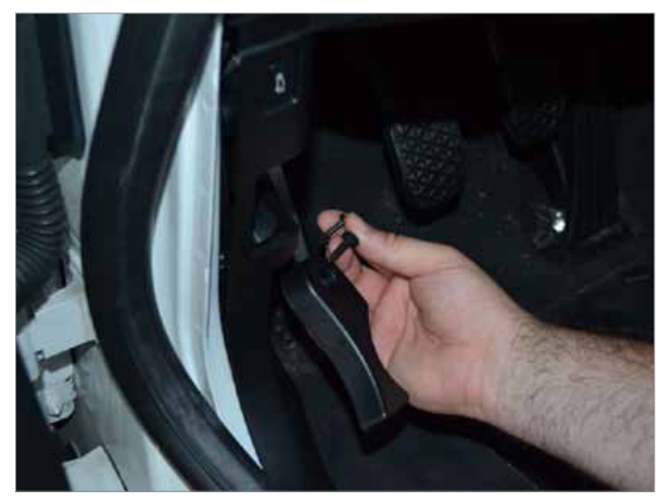
Replace the hood pop lever and then replace the footwell cover below the steering wheel.

Neither P3 Cars, nor its dealers or agents shall be liable in any way, for any damage, loss, injury or other claims, resulting from the installation or use of this product. By purchasing or installing this product, you assume all liability of any kind connected with the use and/or application of this product. If you are unsure that you can safely install and use this product, consult a qualified installer or mechanic. The warranty on this product covers only the product itself for a period of 6 months from the date of purchase, and it will be at our discretion to repair or replace the affected parts. No user serviceable parts inside. Warranty will be voided if product shows physical damage.