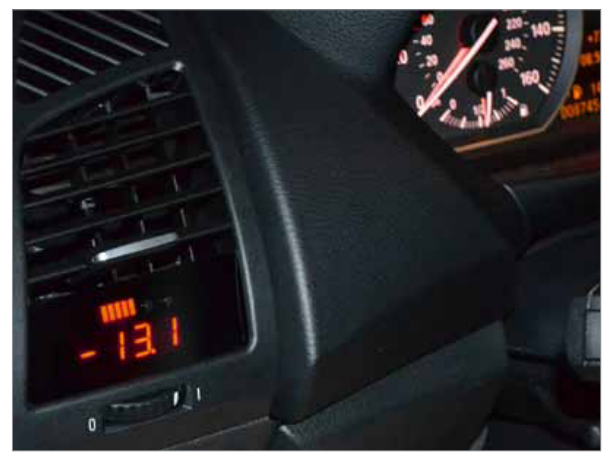
Start the engine and make sure the gauge turns on now that everything is hooked up properly, then fully re-install the vent and surrounding panels/trim.