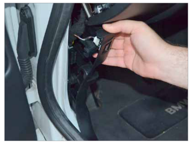
Flex this panel forward to get access to the OBD2 port and the trunk pop switch. You will need to pull the rubber door seal forward to free the panel.