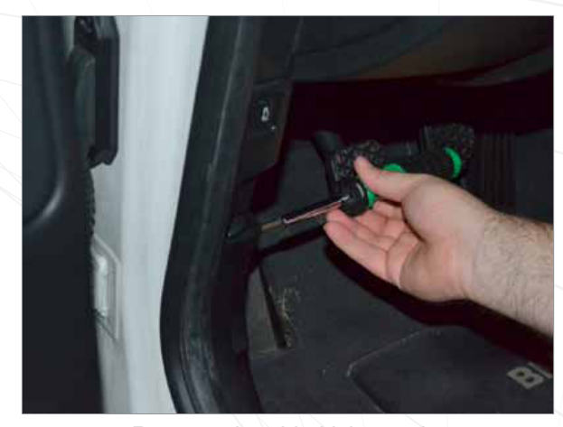
Remove the side kick panel cover screws, first remove the Phillips screw holding the hood pop lever, then the screw behind the lever. 2 screws total.