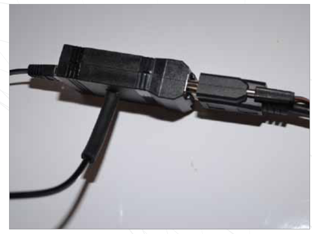
Connect the vacuum line and harness to the control box as shown. (note: for versions earlier than 2.1, the vacuum port is on the harness)