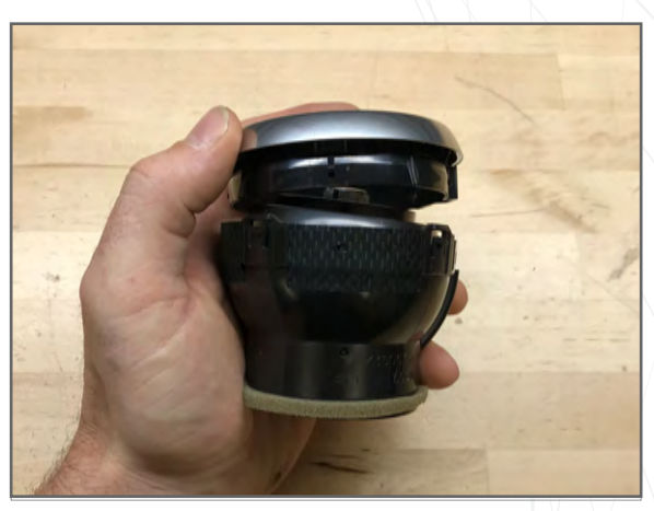
Remove trim ring from housing

WARRANTY & LIABILITY: Neither P3 Cars, nor its dealers or agents shall be liable in any way, for any damage, loss, injury or other claims, resulting from the installation or use of this product. By purchasing or installing this product, you assume all liability of any kind connected with the use and/or application of this product. If you are unsure that you can safely install and use this product, consult a qualified installer or mechanic. The warranty on this product covers only the product itself for a period of 6 months from the date of purchase, and it will be at our discretion to repair or replace the affected parts. No user serviceable parts inside. Warranty will be voided if product shows physical damage.