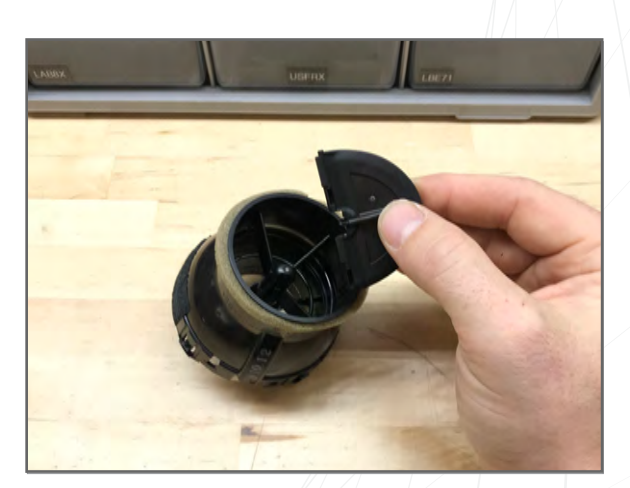
Remove flaps from housing