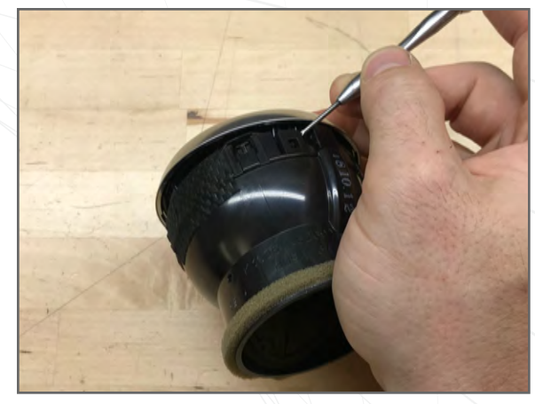
Using a small screwdriver release the tab on the bottom of the vent (6 O'clock position)