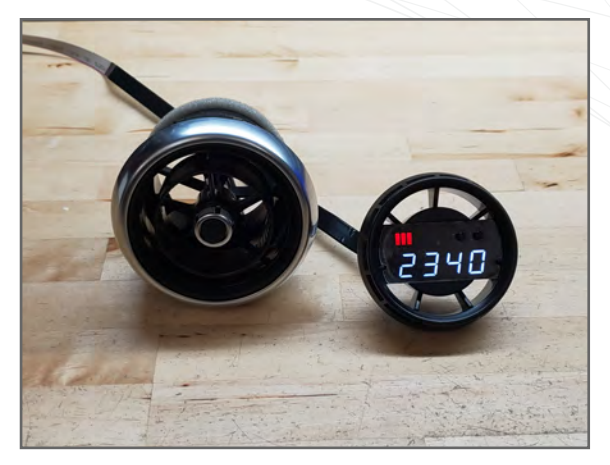
Remove vent from vehicle