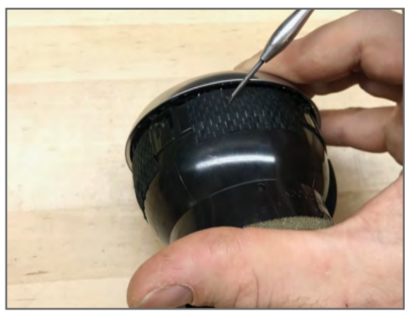
Release three remaining tabs under felt at 3, 9, and 12 O'clock positions